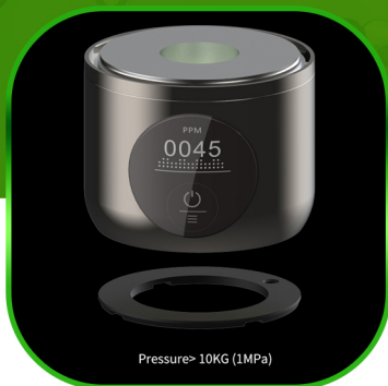
PRESSURE BEARING DESIGN

Free radicals, known as 'cell destroyers', are aggressive oxygen molecules. Because they are extremely unstable, they are always waiting for opportunities to steal an electron from other oxygen molecules, causing other oxygen molecules to be destroyed. When the number of destroyed oxygen molecules reaches a certain amount, wrinkles, illnesses and other undesirable consequences begin to appear.