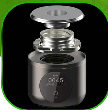
TITANIUM PLATED PLATINUM + MEMBRANE ELECTRODE MATERIAL