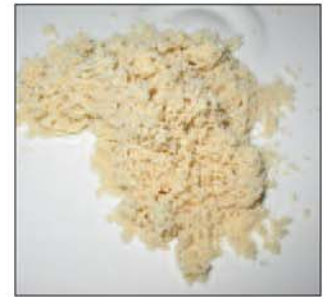
ScaleNet™ Anti-Scale Media

On the other hand, Calcium is important to human health, and supplements are recommended if Calcium is reduced or totally void in one's diet.