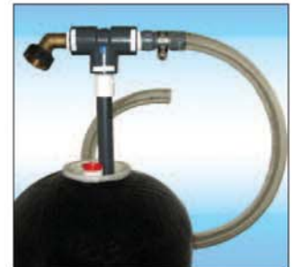
Extraction Tool For Media (P/N: D91EXT)

Our trained water quality improvement dealer in your area can complete the media and carbon replacement procedure.