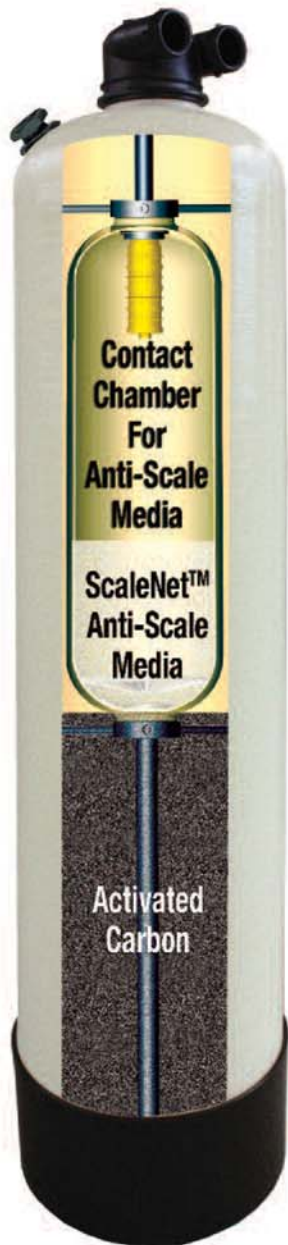
Model # ETREATWCS

they must be backwashed periodically to rinse and refresh the ion exchange resin. Brine water discharge and the need to conserve water have challenged this conventional technology, and new methods to provide scale-free water are being considered.